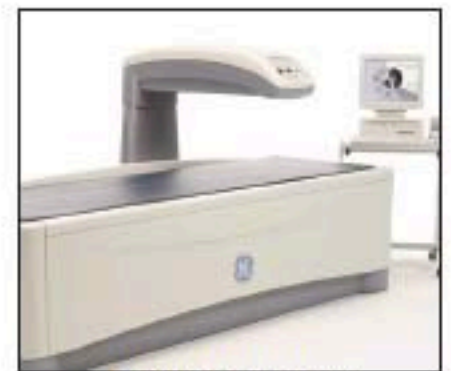
BONE DENSITY Linear Precision Positioning

Your local BDI representative is trained and knowledgeable on the products and services offered. You can count on BDI for information and updates on new products and innovations that positively impact your operations.